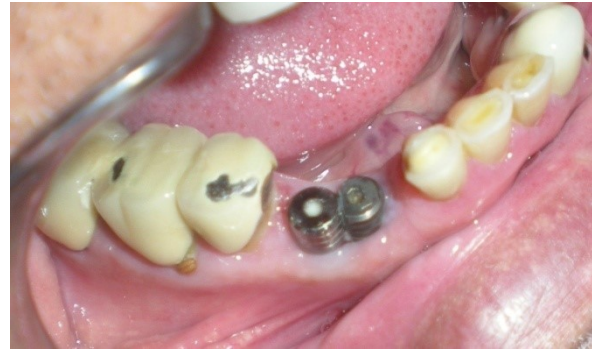
Figure 2. Modified healing abutment in position.