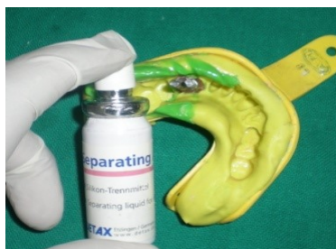
Figure 7. Application of separating spray