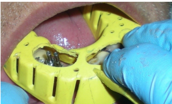
Figure 5. Plastic stock tray with access window over the copings.