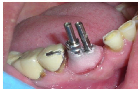
Figure 4. Modified impression copings splinted with unmodified coping with autopolymerizing acrylic resin.