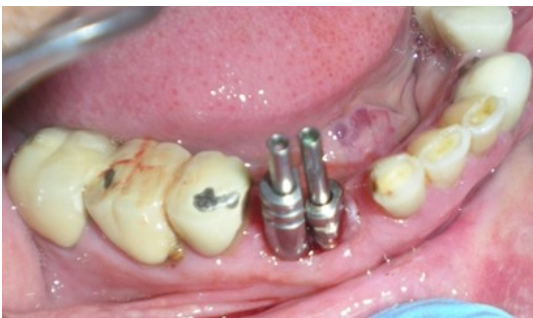
Figure 3. Modified impression copings in proper position.