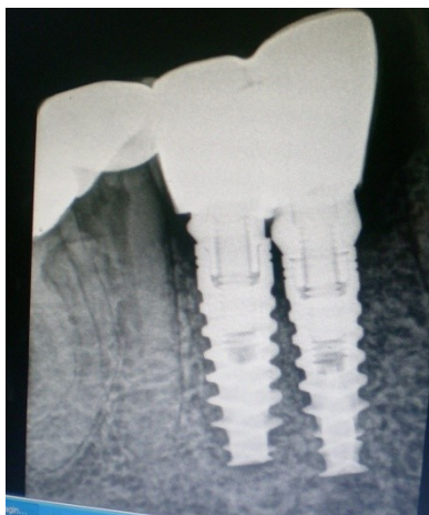
Figure 9. Radiograph verifying the fit of the abutment