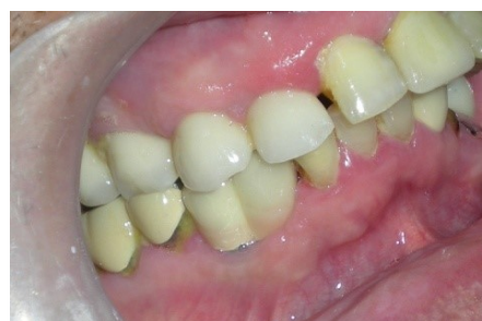
Figure 10. Definitive Prosthesis

the application of artificial gingiva (Esthetic mask, Detax, Germany) for easy separation of artificial gingiva from impression material as both are silicones. The artificial gingiva was applied around impression copings and the impression was poured with type IV gypsum product ((Kalstone; Kalabhai Karson Pvt. Ltd. India) to obtain the master cast (Figure 8), which, with a soft tissue gingival mask, will allow the restorative dentist and technician to choose the ideal abutment and technique for the case. Further, the accuracy of the impression was verified with verification jig. the verification jig should fit passively on the cast as well as in patient mouth. After verification jig trial, the prosthesis (two joined PFM crowns, figure 9 and 10) was fabricated over two modified castable UCLA abutments (PLA-R straight plastic abutments, AlphaBio, Israel). The final prosthesis was cemented with chemical cure resin cement.