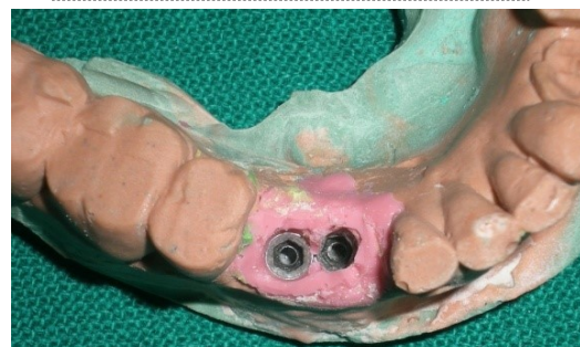
Figure 8. Master cast with artificial gingiva